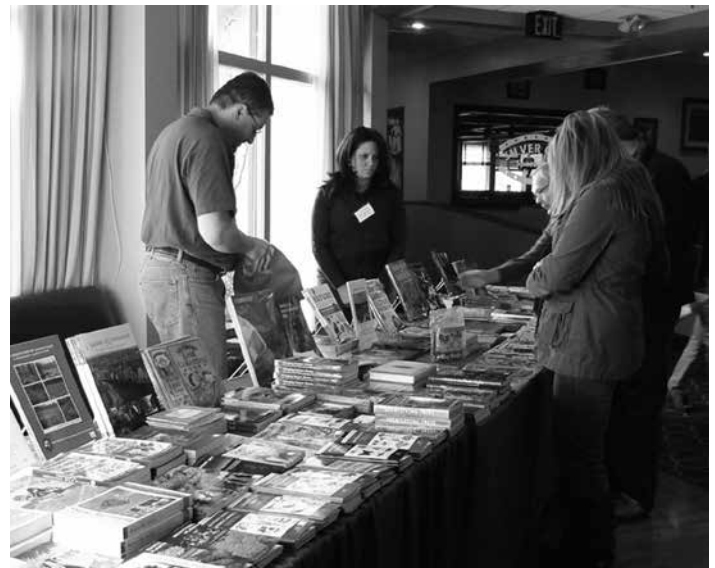
Display Table: CT Department of Energy and Environmental Protection's Book Store.

Four newly organized workshop tracks were introduced at the 2012 annual conference: Open