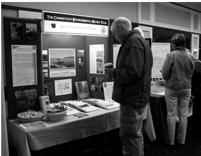
Display Table: CT Environmental Review Team